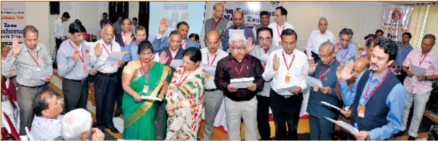
Oath taking by Elected Directors