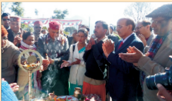
Lighting of lamp by Chief Guest