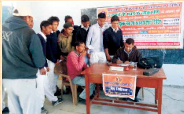
Doctor writing prescription