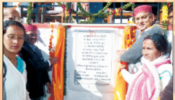
Laying of Foundation Stone