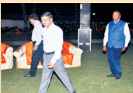
Sh. Ajay Chaudhury IPS OSD to Lt. Governor Delhi