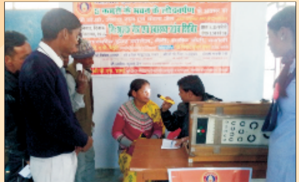
Examination of Eye.