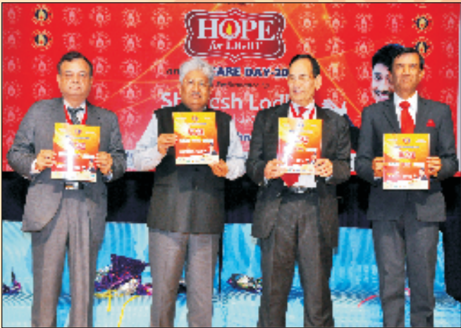
Release of Souvenir JAN SEWA 2014