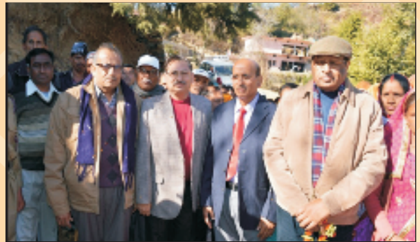
CAO, Jt. Secretary, Vice-Chairman & Chairman Finance MID at the function.