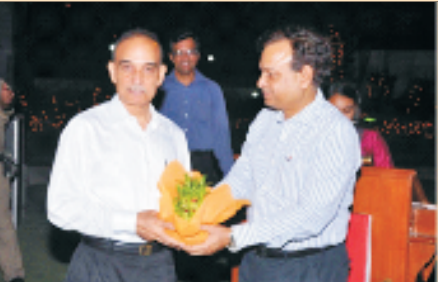
Dr. S.P. Singh IPS MP Baghpat