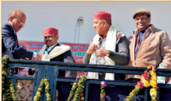
Honor Of Guest of Honor by Vice-Chairman MID.