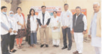
चितीड़गढ़ में निःशुल्क नेत्र स्वास्थ्य शिविर का आयोजन हुआ। इस कार्यक्रम में 272 रोगी लाभावि हुए।

चितीड़गढ़ में 27-12-2023 को निःशुल्क नेत्र स्वास्थ्य शिविर का आयोजन हुआ। इस कार्यक्रम में 272 रोगी लाभावि हुए। कार्यक्रम में 272 रोगी लाभावि हुए। कार्यक्रम में 272 रोगी लाभावि हुए।