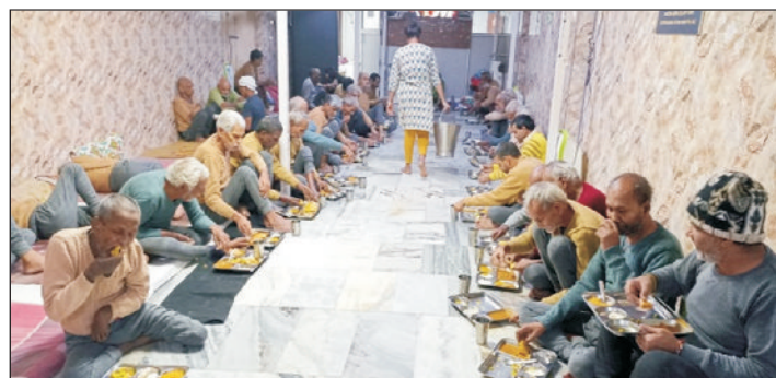
Guru Vishram Vrid Ashram, Gautampuri