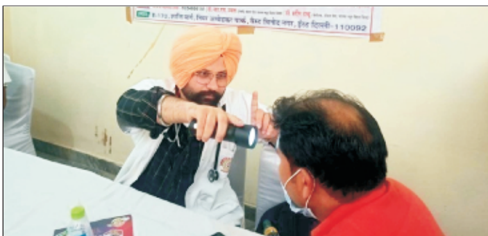
Screening of Eye