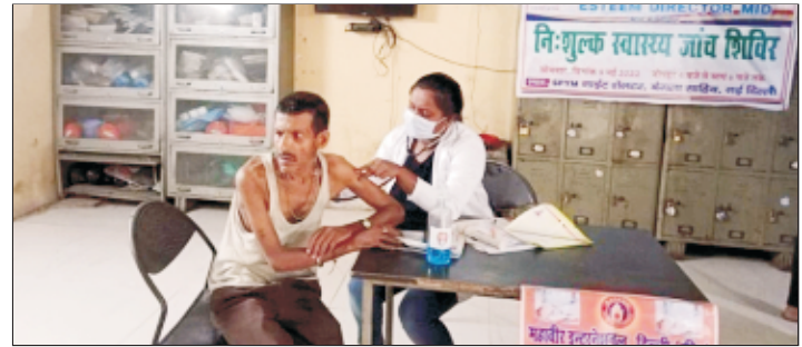
Examination of Patient