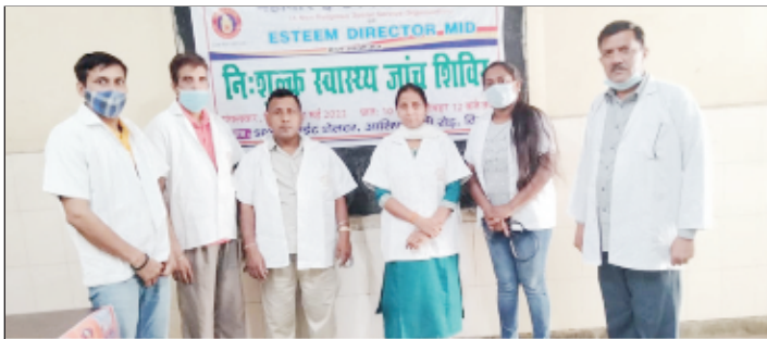
Team Mahavir International Delhi