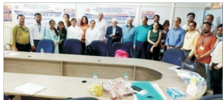
Team, CONCOR AIR, MID, Mahavir International West Zone & Mumbai