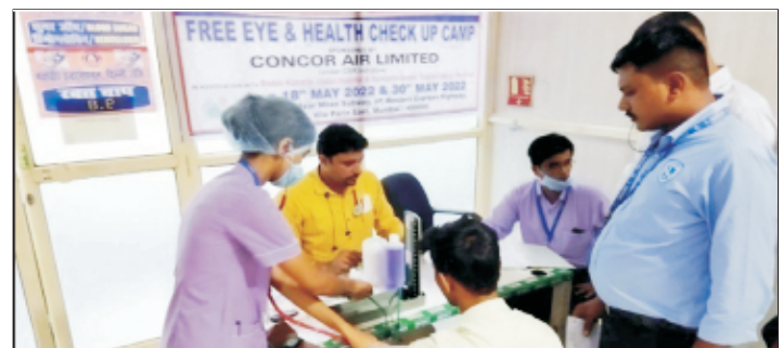
Checking of BP & RBS