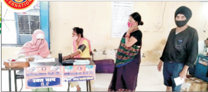
Checking of BP