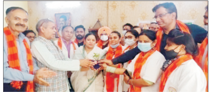
Felicitation of VIP