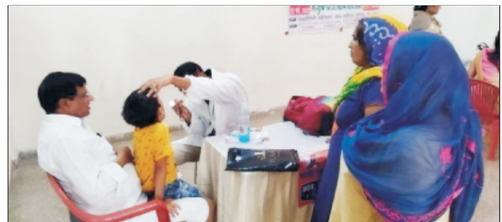
Examination of Eye