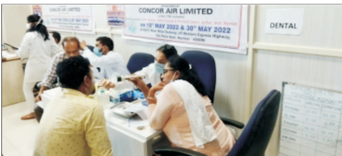
Examination of Ear & Counselling