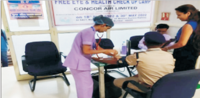
Checking of Blood Pressure