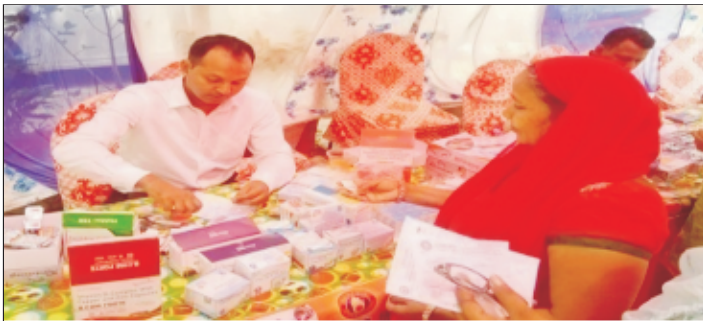
Free medicine distribution