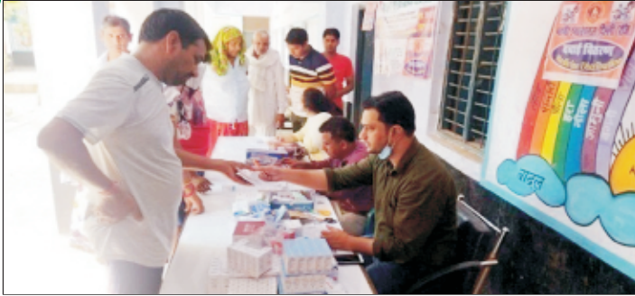
Distribution of Medicine