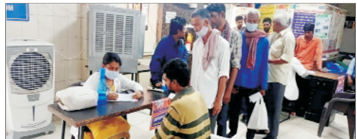
Doctor Writing Prescription