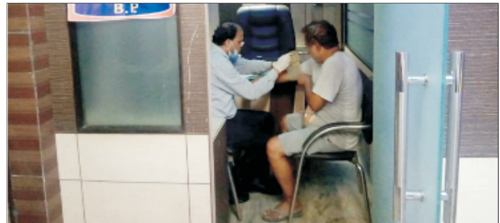
Checking of RBS