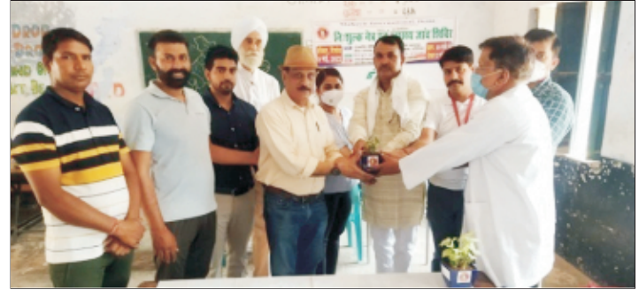
Honor of VIP