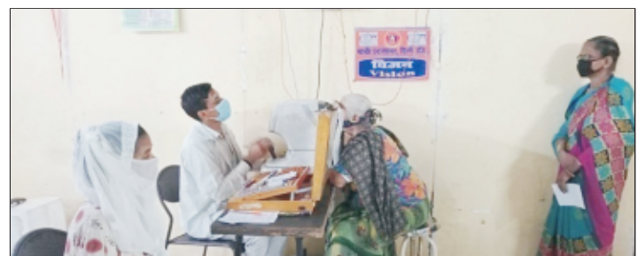
Checking of Refraction through AR Machine