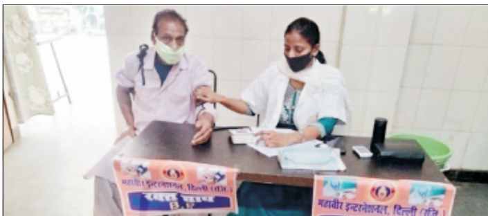
Checking of BP