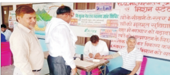
Blood Sugar testing of the patient