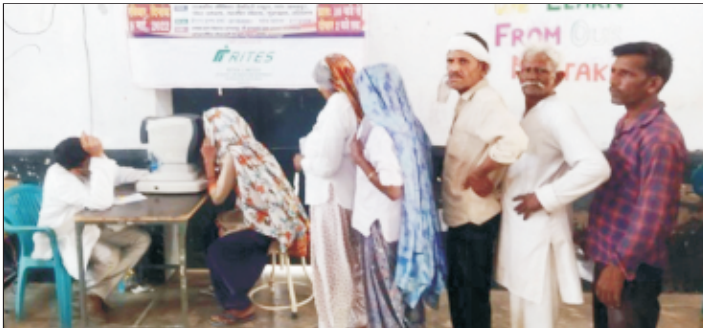
Checking of Eyes through AR