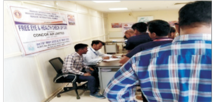
Patients waiting for Registration