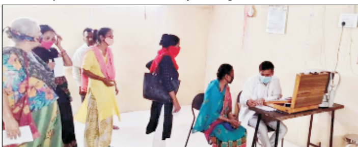
Checking of Near Vision