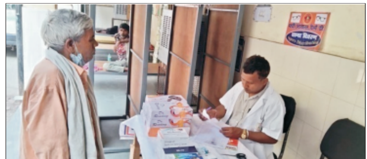
Distribution of Medicine & Spec