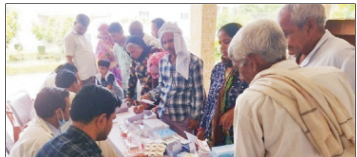
Distribution of Medicine and Specs