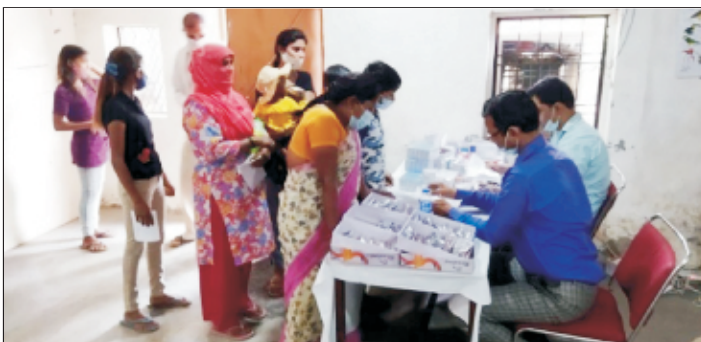
Distribution of specs