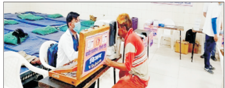
Testing of Refraction