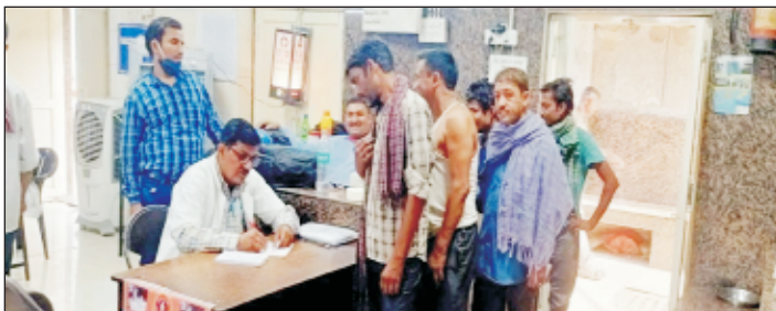
Registration of Patients