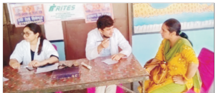
Consultation with Doctor