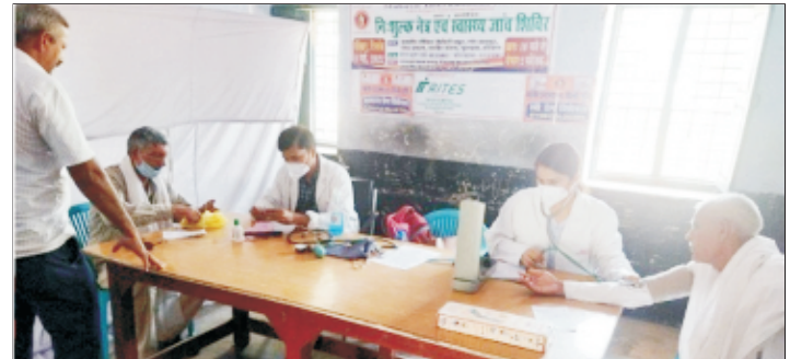
Examination of patient BP & Prescription by the Doctor

Mahavir International Delhi is highly indebted to MI West Zone & MI Mumbai for the support extended in successful culmination of the camps being organized by them. MID is proud of our MI family who always stands shoulder to shoulder to achieve the goal.