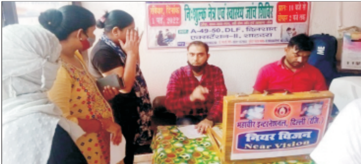
Checking of Vision