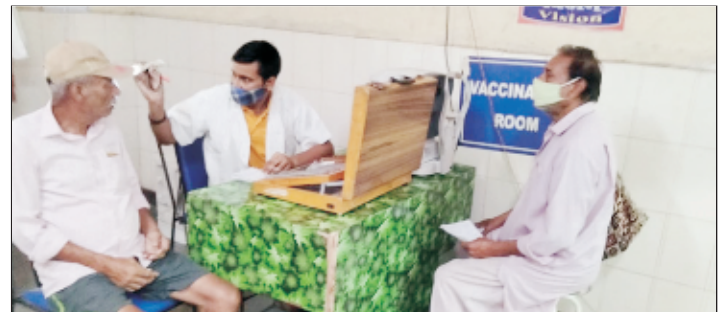
Checking of Eyes