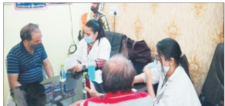
Consultation with Doctor

13. Chandragiri Vatika, Jain Mandir Dehra, Tijara, Alwar (Raj)