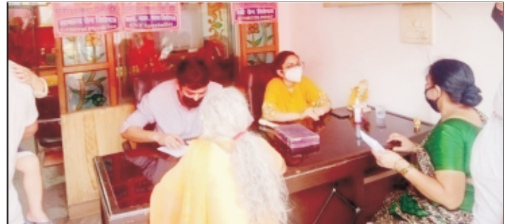
Consultation with Doctor