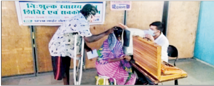
Testing of Eyes through AR