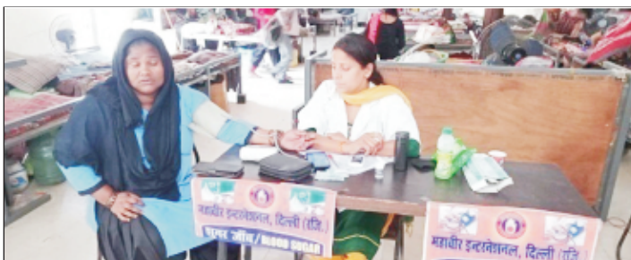
Checking of BP