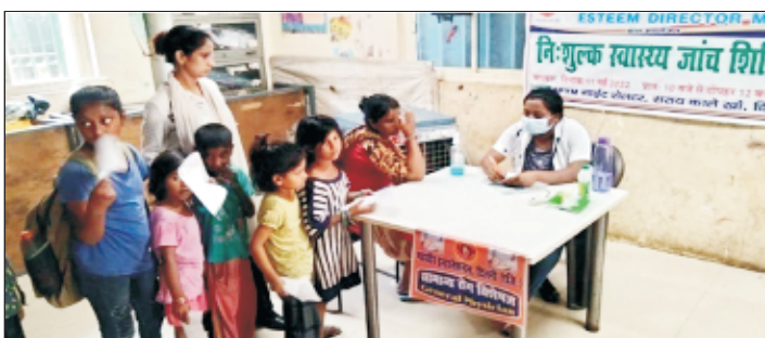
Counselling to Patient by the Doctor