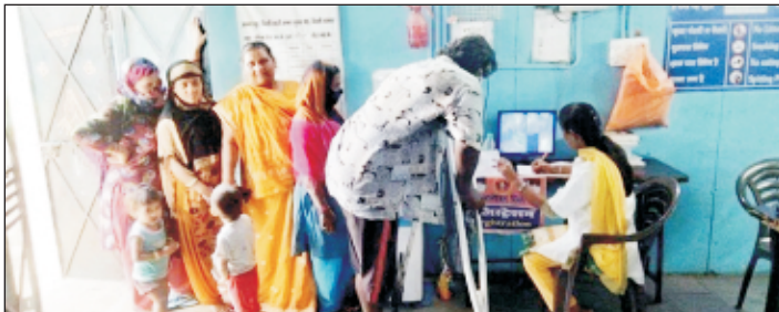
Registration of Patients