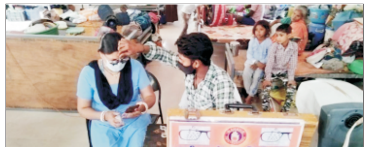
Checking of Near Vision