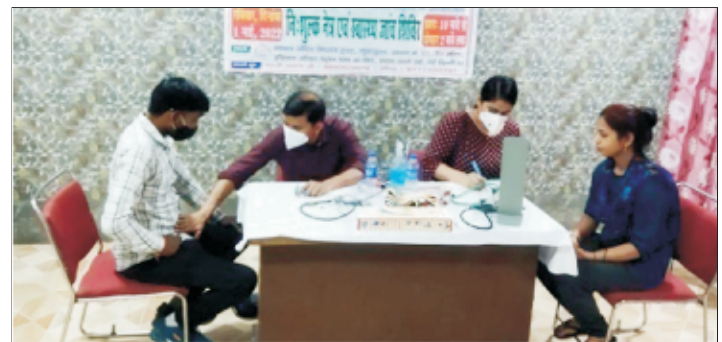
Examination & Prescription to Patient