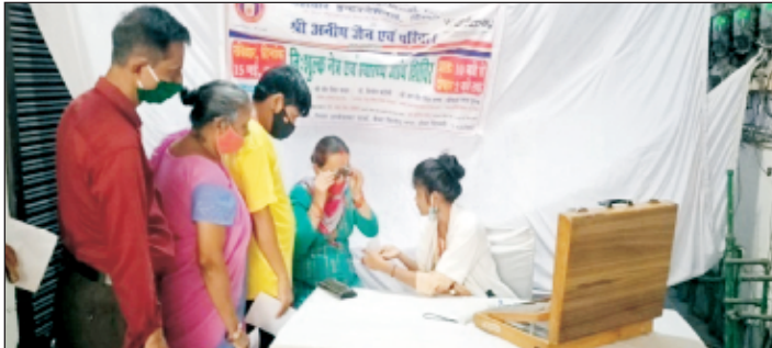
Checking of Near Vision