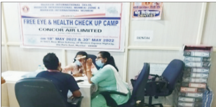
Examination of Eye