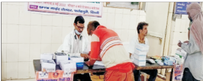
Distribution of Specs & Medicine