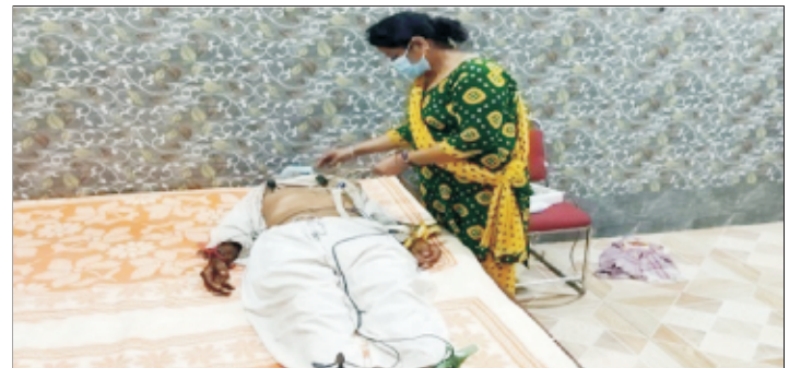
ECG in progress