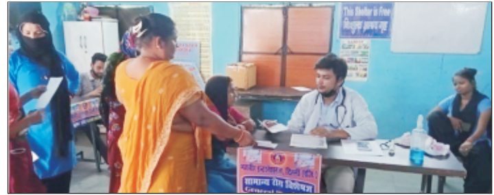
Consultation with Doctor