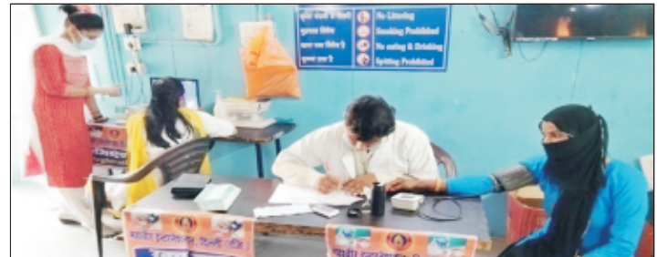
Checking of BP