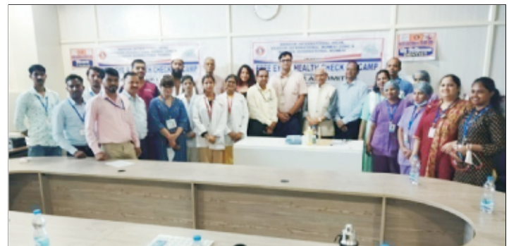
Team, CONCOR AIR, MID, Mahavir International West Zone & Mumbai