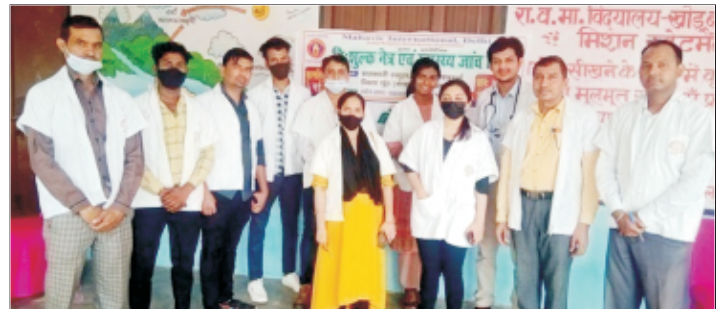
Team MID at the camp site