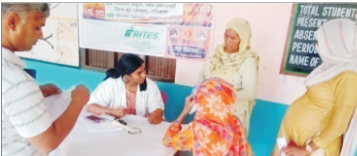
Counselling to Patient by the Doctor