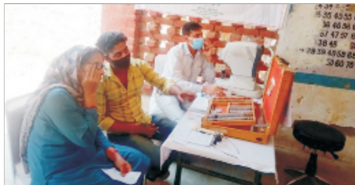
Checking of Vision