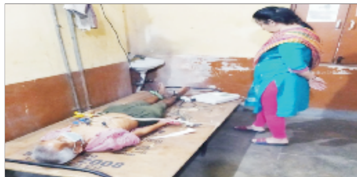
ECG in Progress