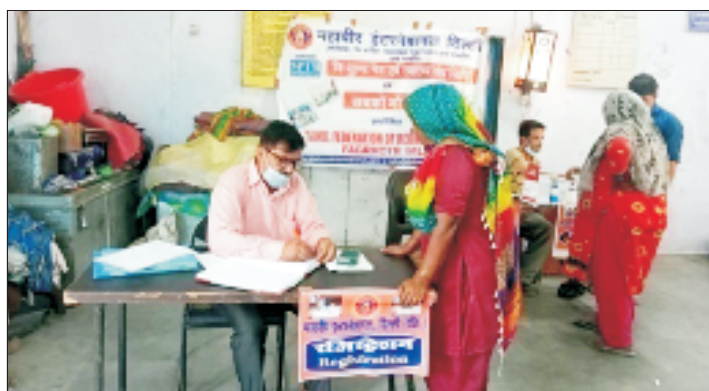
Registration of Patients