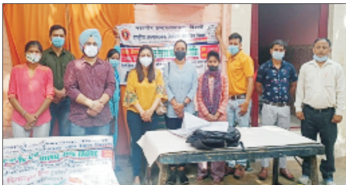
Team MID at the camp