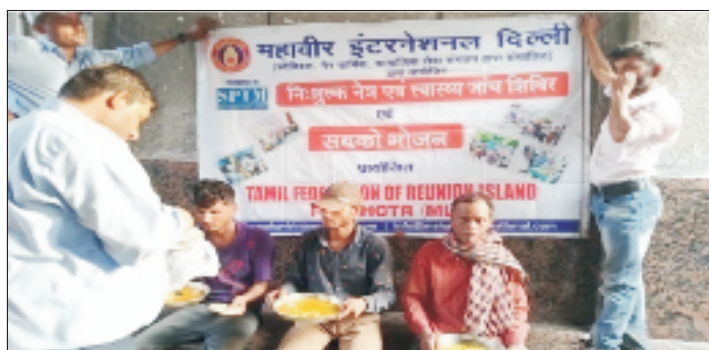
Serving Free Food to the needy at the camp