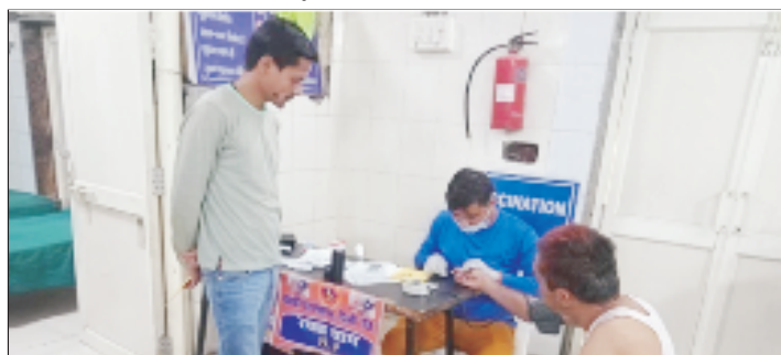
Testing of Blood Sugar