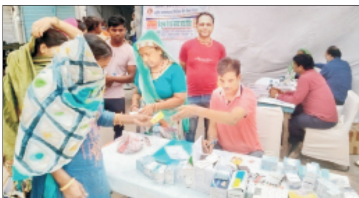
Free Distribution of Medicines