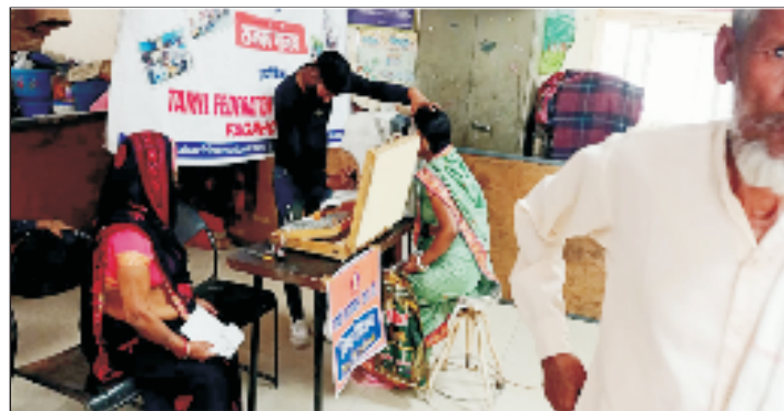
Examination of Eye