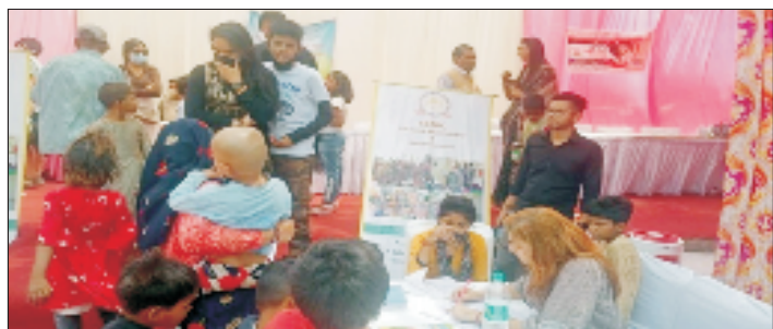
Registration of Patients