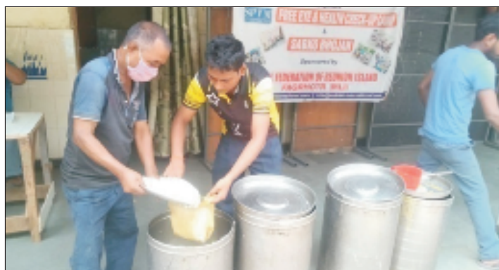
Distribution of Food in camp