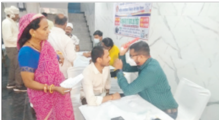
Examination of Eye