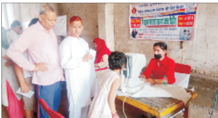
Checking of Refraction through AR machine