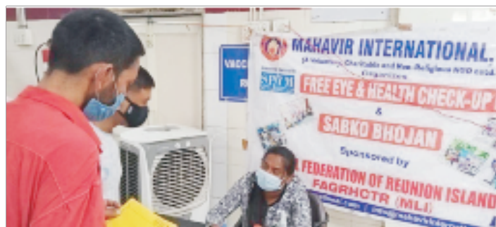
Counseling by the Doctor