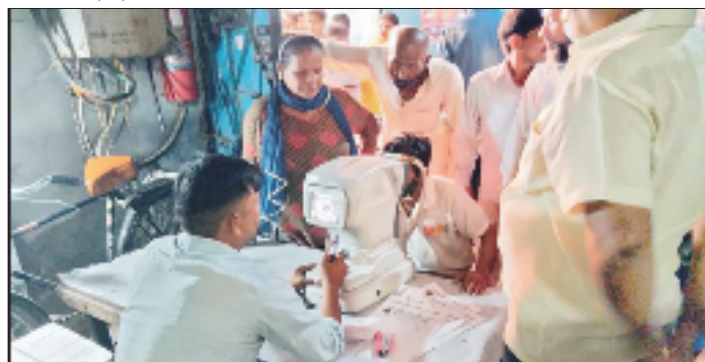
Screening of Eye