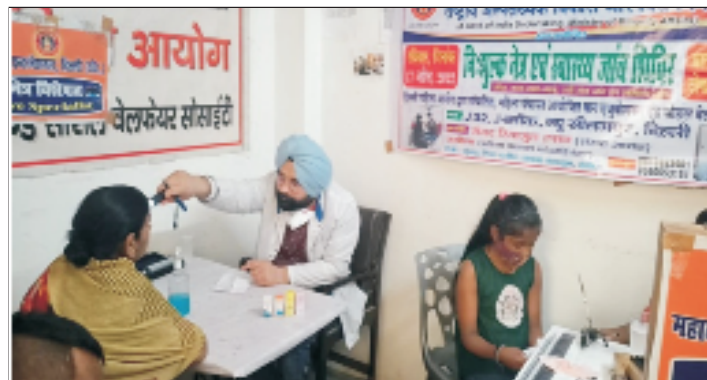
Examination of Eye