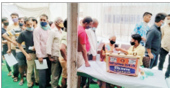
Counselling by the Doctor