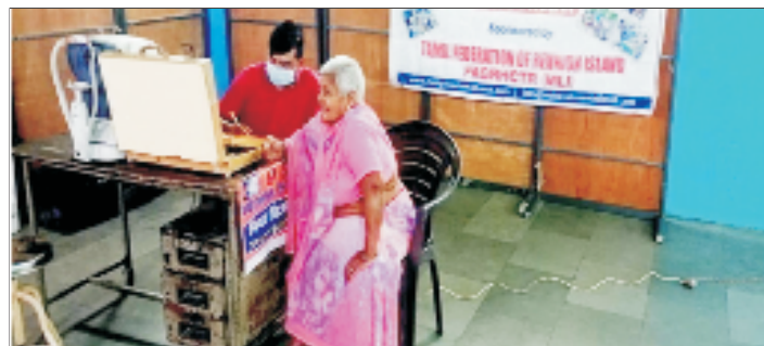
Checking of Near Vision