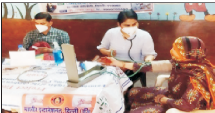
Counselling by the Doctor