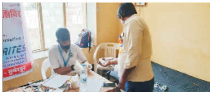
Testing of Blood Sugar