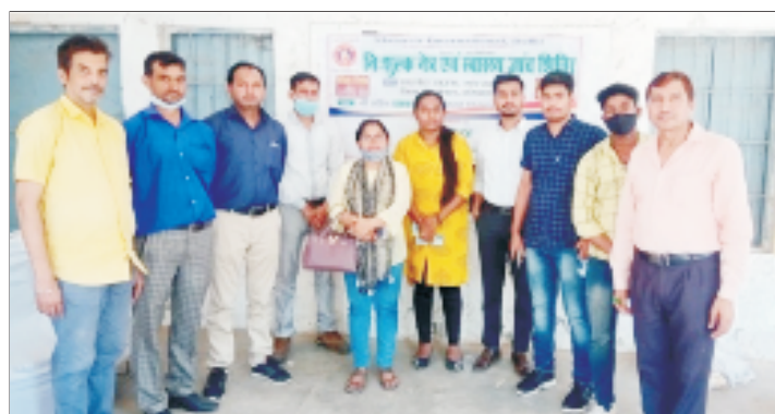
Team Mahavir International, Delhi