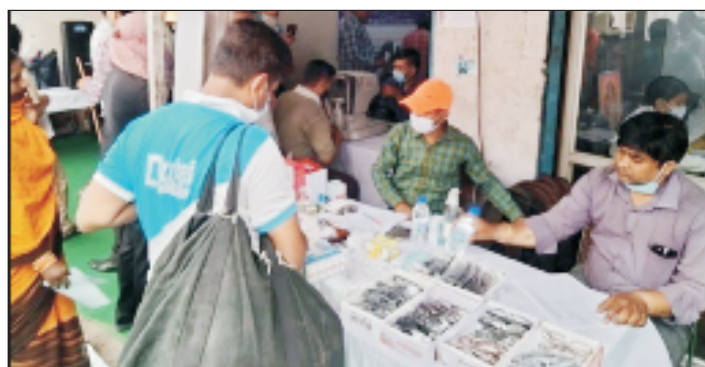
Checking of Refraction through AR machine

16. Shop No. 3103/4, Bahadurgarh Road, Sadar Bazaar Delhi - 110006