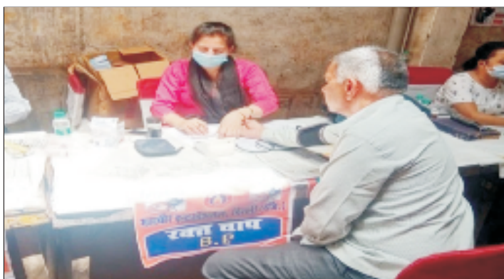
Checking of BP