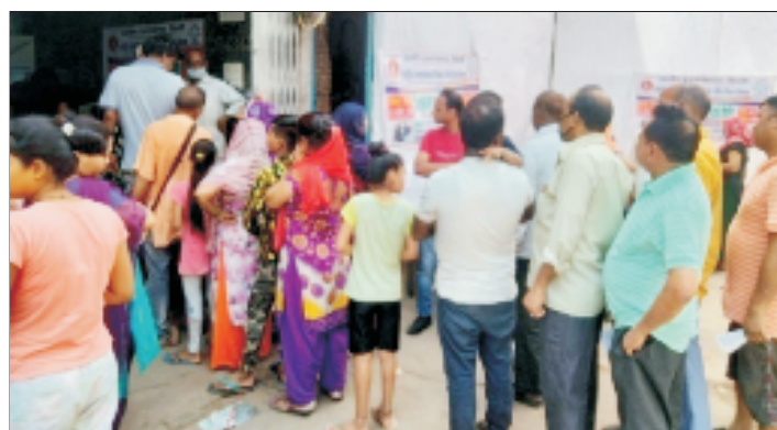
Patients Waiting for Registration