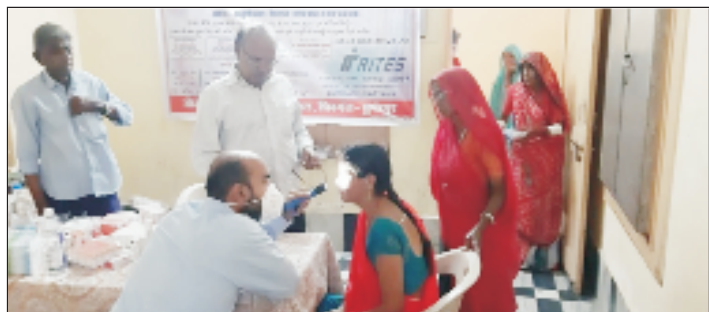
Examination of Eye