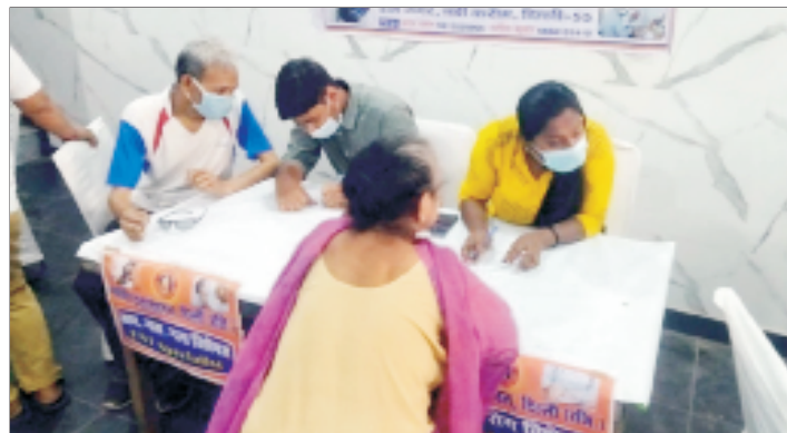
Consultation with Doctor