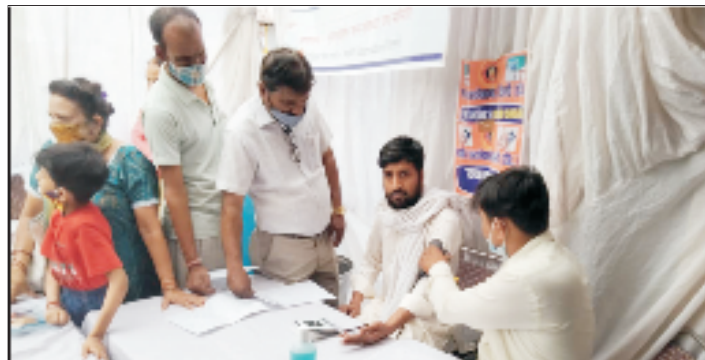
ECG in Progress