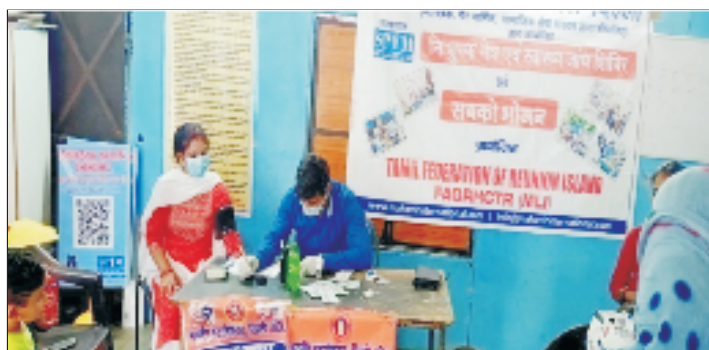
Checking of BP