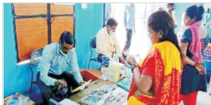
Free Distribution of Spectacles