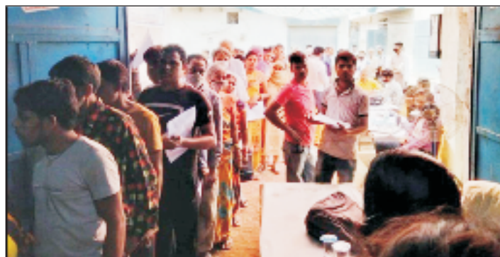
View of Camp