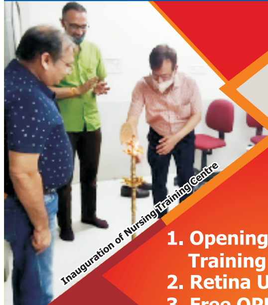
Inauguration of Nursing Training Centre