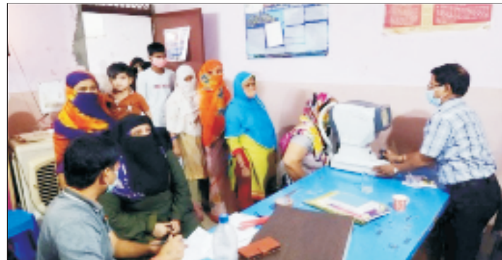
Testing of Eye through AR Machine