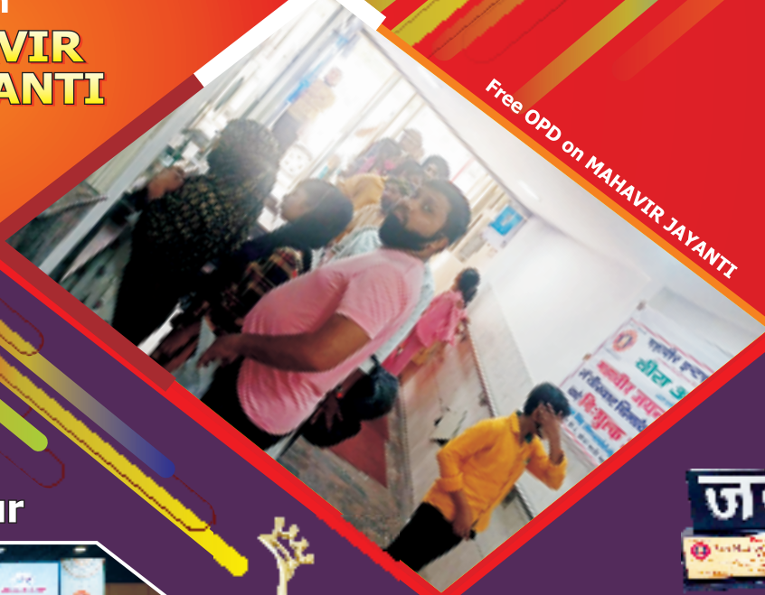
Free OPD on MAHAVIR JAYANTI

'JAZBA' 3 rd NATIONAL VIRA CONVENTION -Udaipur