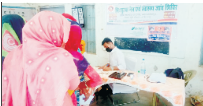
Registration of Patients