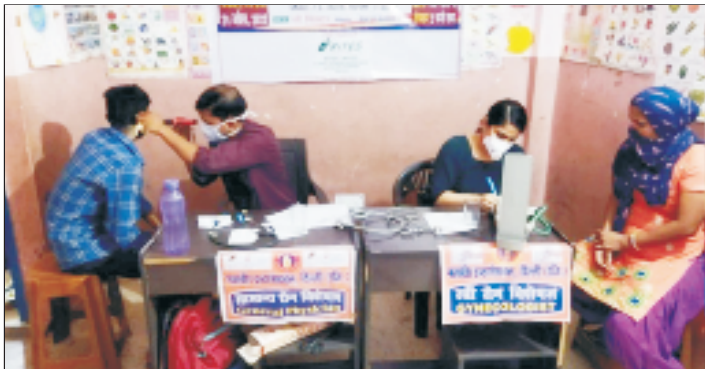
Examination of Ear