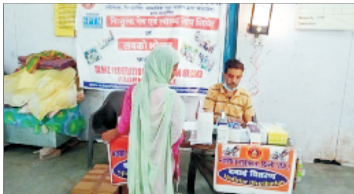
Distribution of Medicines