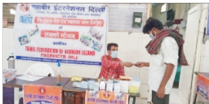
Distribution of Medicines