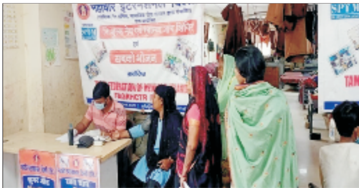
Checking of BP / Sugar