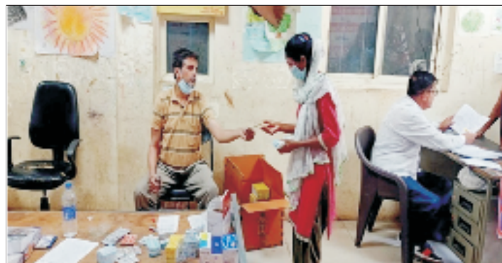
Distribution of Medicines

SPONSORED BY : National Minorities Development & Finance Corporation (NMDFC) (Eye & Health check up)