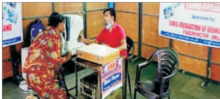
Checking of Eyes through AR machine