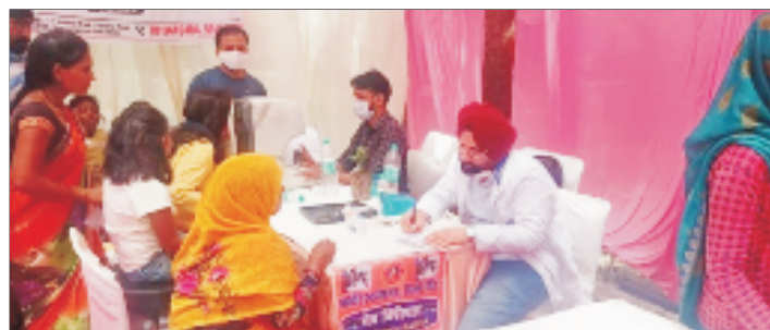
Counseling by the Doctor