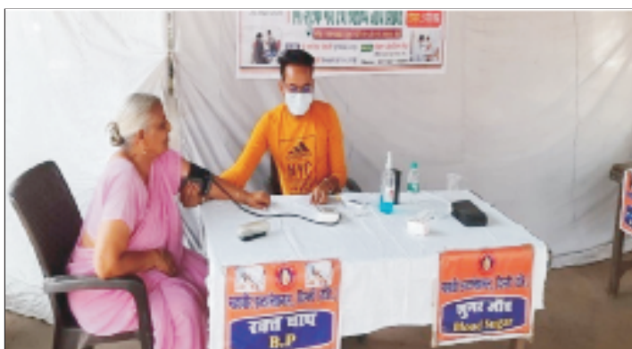
Checking of Blood Pressure