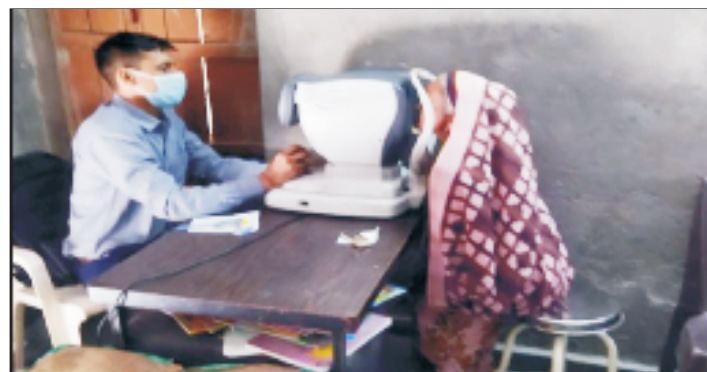
Checking of refraction through AR machine