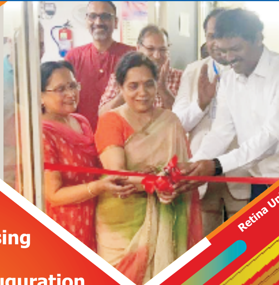
Retina Unit Inauguration