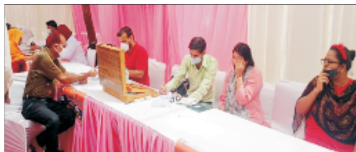
Testing of Vision