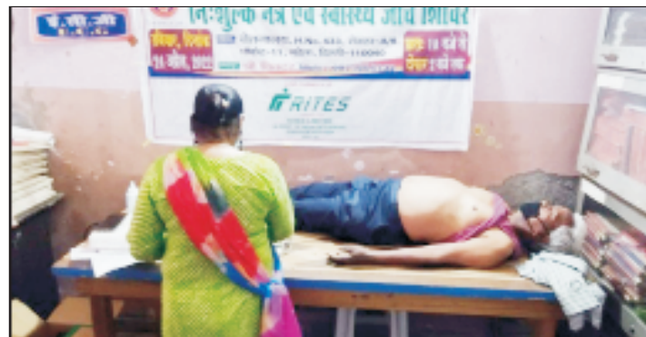
ECG in Progress

12. Sarpanch House, Village Hasanpur, Dist. Nuh Mewat, Haryana