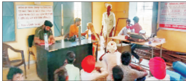
Checking of Near Vision