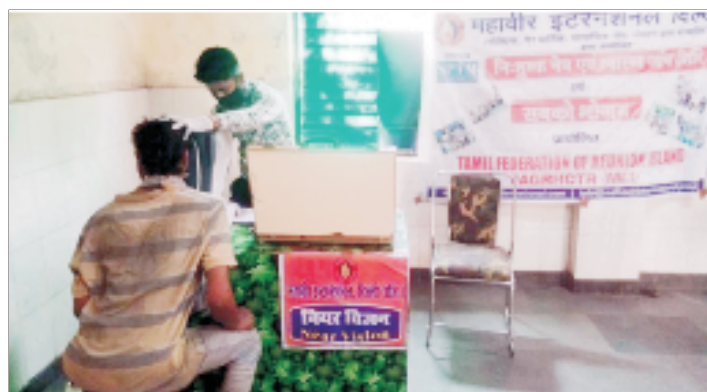
Testing Refraction through AR