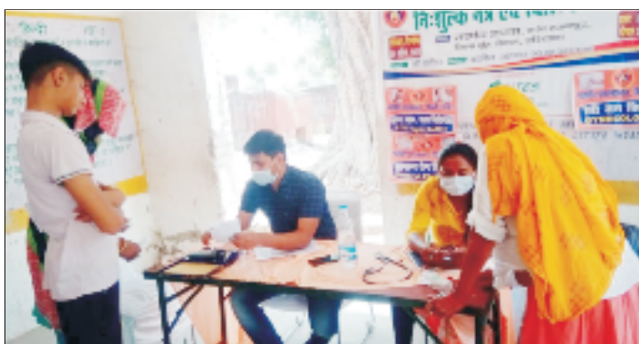
Counselling by the Doctor