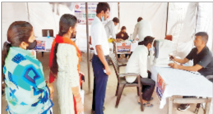
Examination of Eyes through AR machine