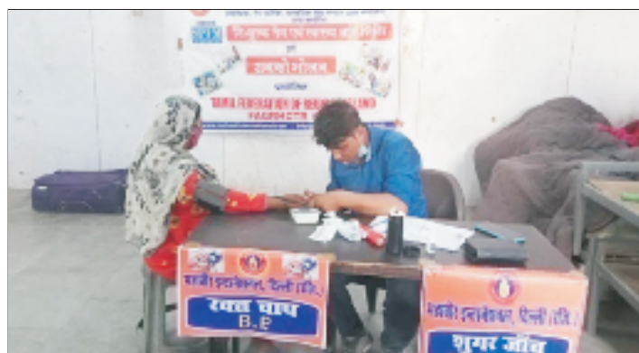
Checking of BP & RBS