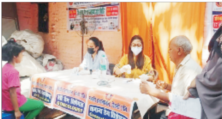
Consultation with the Doctors