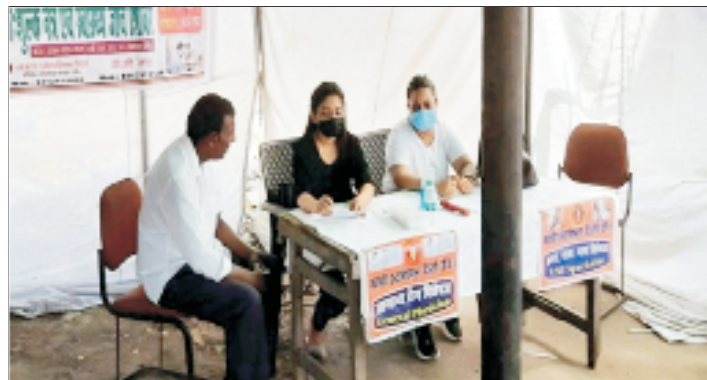
Counselling by the Doctors