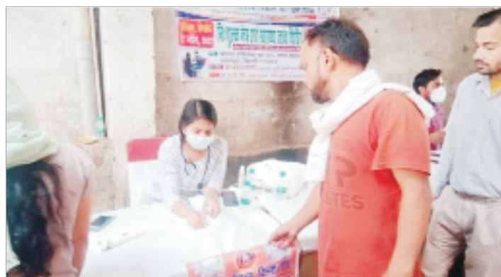
Counselling by the Doctor