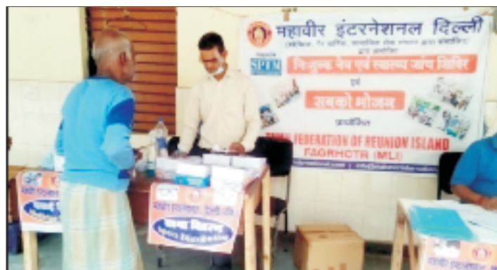
Distribution of Spectacles